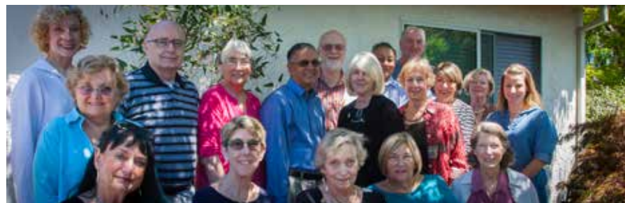
CCIS Board Members - 2015/16

June 1st - Picnic on the Oval, 5-7pm, The Oval